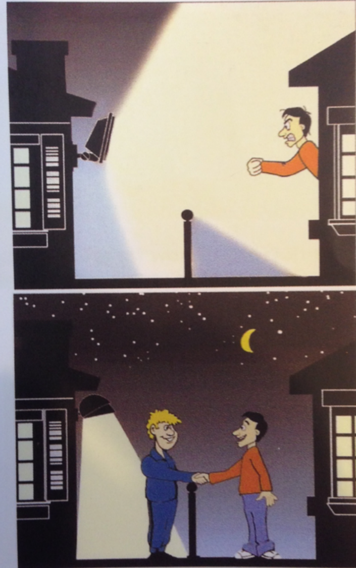
Graphic by RAB Lighting