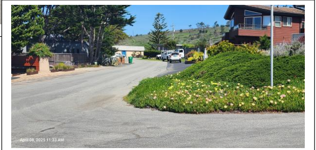
Corners need visual clearance and parking should be discouraged.