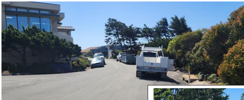
Instead of fence, landscaping used for pushing parking and pedestrians away. The ditch complicates parking.