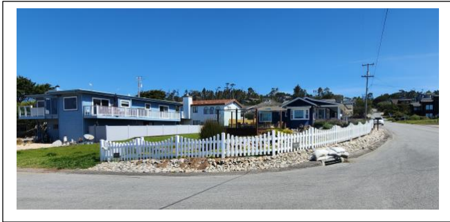
This illustrates the most blatant intent of Homeowner to capture public ROW to utilize for private purposes and keep parking away from the residence. This lot would be flat