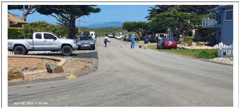
Best example of homeowners sharing public ROW and accommodating access and parking. Note even with a vehicle using the road pedestrians can be accommodated.