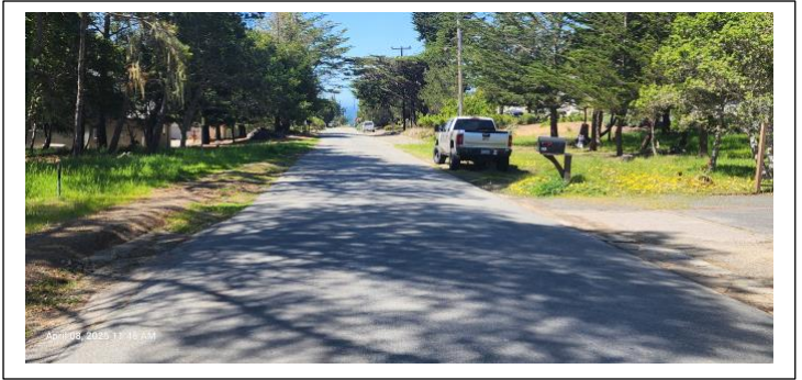
Low development housing areas seldom are issues. But view lots neighborhoods are just the opposite. These areas give the impression that Cambria does not have a parking issue.